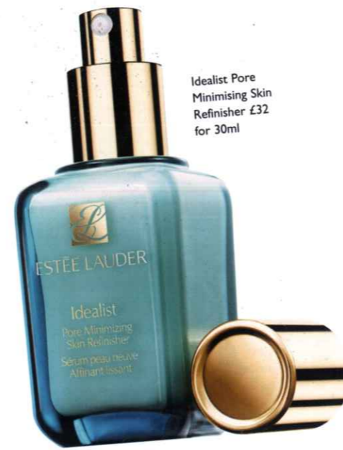
Idealist Pore Minimising Skin Refinisher £32 for 30ml