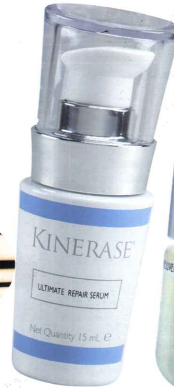
Kinerase Ultimate Repair Serum £48 from www.beautyicon.co.uk