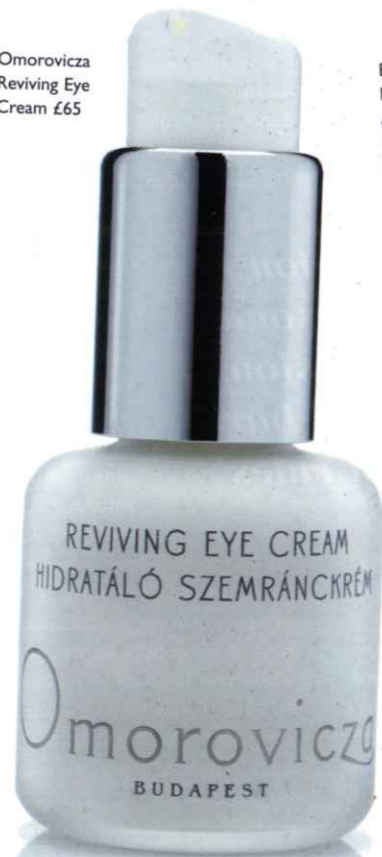
Omorovicza Reviving Eye Cream £65