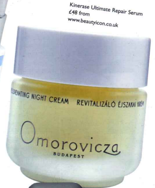
Kinerase Ultimate Repair Serum £48 from www.beautyicon.co.uk